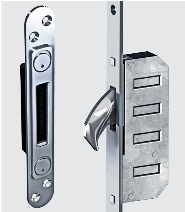
Standard 24mm wide keeps with dust boxes and off-set screw fixing for enhanced security.

Superbly engineered and manufactured in Germany the Trulock + Locking system is approved by the Police 'Secured by Design' security initiative. This important independent endorsement is an essential requirement of the Association of British insurers.