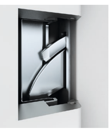
Door open: Weatherseal hook and hook retracted.