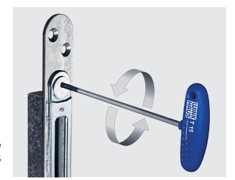
Keeps fully adjustable \pm 2 mm utilising Torx T15 adjusting tool.

Special design tensile steel handed hook with a 4.5mm chamfer allows a high degree of fitting tolerance for door installation. In addition the hook shape provides low operating forces and helps doors achieve a higher level of weather performance.