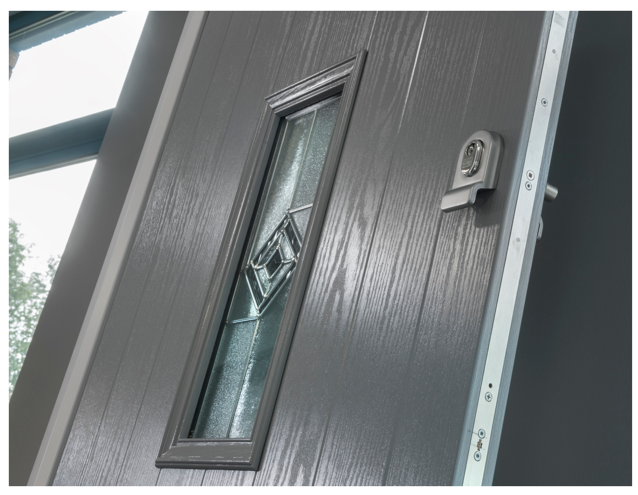
*Please note: For doors with a lever handle on the outer side, the hooks will engage but the door will not automatically lock. To lock the door, you will need to use the key to manually do this.